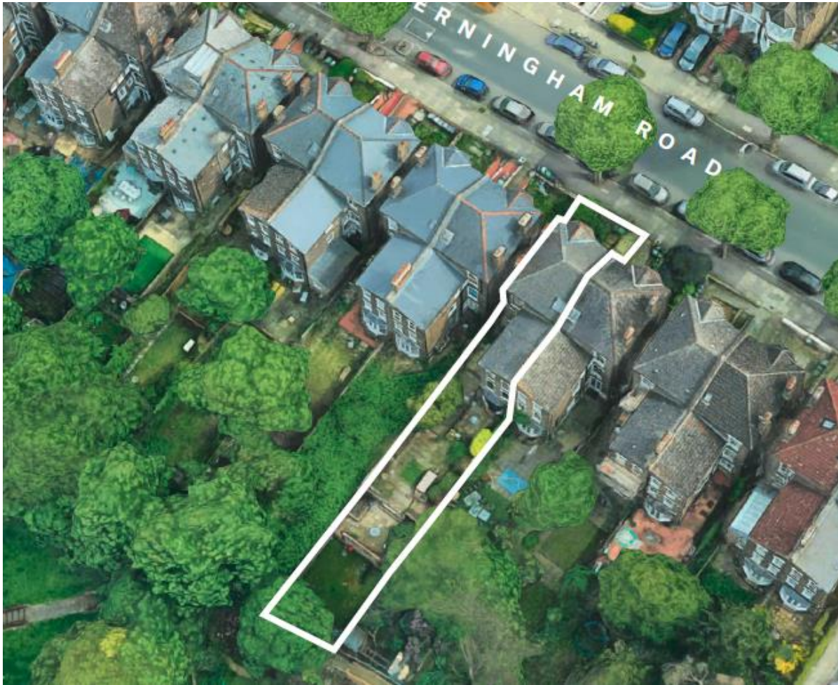
Existing Aerial View